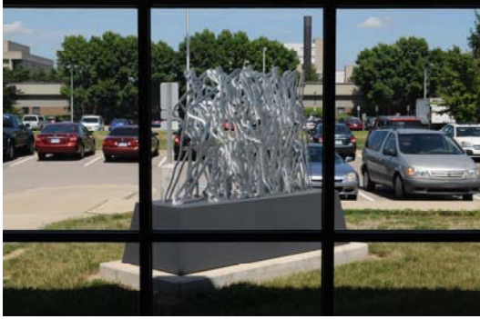
Figure 1. Charles McGee Sculpture

The second issue involved the decoration of the main hallway that runs the length of the building. After much discussion with ideas that ranged from photographs of old cars to simply letting the walls stand bare, it was decided that continuing the focus that began with the McGee sculpture at the entrance was logical. Original art work that reflected the research going on in the building would be an appropriate way to enhance the building's walls and foster the connections between art and engineering. More discussion ensued and after it was decided that instead of simply going out and buying professionally created art work, the conclusion was to approach local high schools and ask for their student's artistic contributions. This approach would serve three distinct purposes: produce art for the walls, give high school students a chance to express themselves within an engineering context, and open up possible avenues for students who had never thought of engineering as a career path. The last issue addressed the current high school students who would like to be able to delve into engineering without leaving their fine arts interests behind.