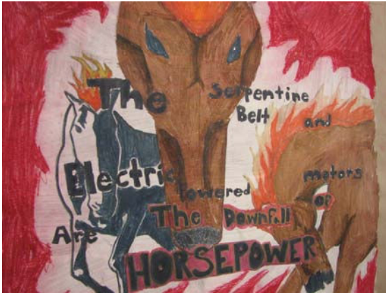
Figure 4. Brett Thorpe - Williamston High School