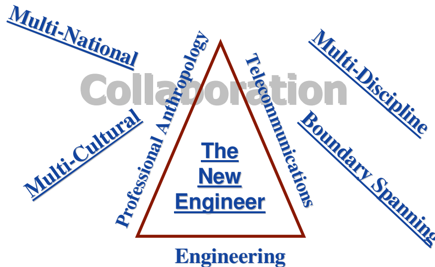
Figure 2: The 21 st Century Professional

global products. The model includes an industrially sponsored project focusing teams of students onto single, coordinated tasks. Figure 2 below illustrates how we have built the model for the new engineer as collaboration between engineering, cultural anthropology and telecommunications to educate students from the three disciplines to break the barriers imposed on multi-national, multi-cultural, multi-discipline and boundary spanning teams. The figure may be understated, but there is great significance to be gleaned from the collaboration of professionals to accomplish education of the new 21 st century professional. Collaborations across nations, across cultures, across disciplines and across boundaries will allow any professional to work effectively in the global environment.